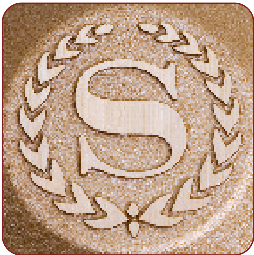
Sanded flat option*