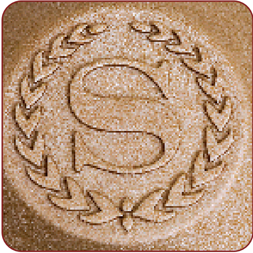
Sculped (natural finish) option*