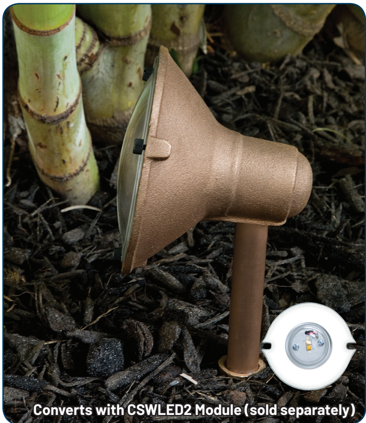
Converts with CSWLED2 Module (sold separately)