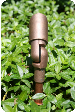
Craftsman Bullet Light with 4" (CCPSTEM4) & (CCPC1) Coupling.