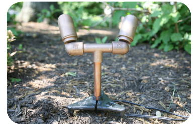
Two Craftsman Bullets with 6" (CCPSTEM6), (CCPT1) connection and Talon Stake (CTSL1).