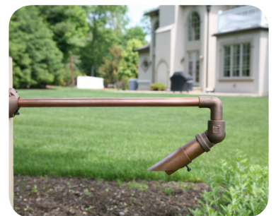
Impressionist Tree Light with the (CCPL1) Elbow connection, 12" (CCPSTEM12), and the mounting canopy (CFM1CBS).