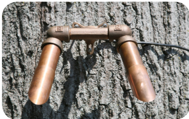
Two Impressionist Tree Lights with the (CCPT1) connection, 2" (CCPSTEM2), and the tree mounting canopy (XCBPTMC1).